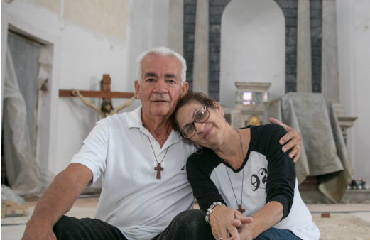
A parish partner helped Our Lady of the Rosary Chapel in Puerto Rico rebuild after Hurricane Maria.